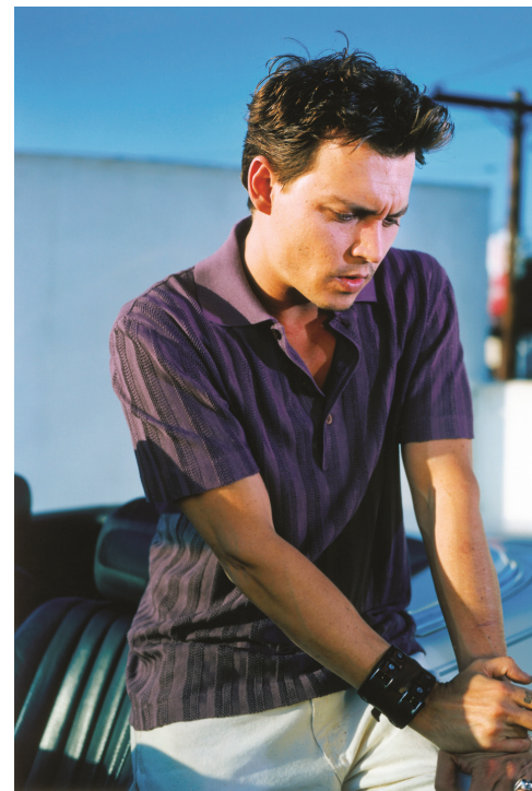
Johnny Depp shot in Los Angeles Santa Monica Boulevard for Premiere magazine 1992