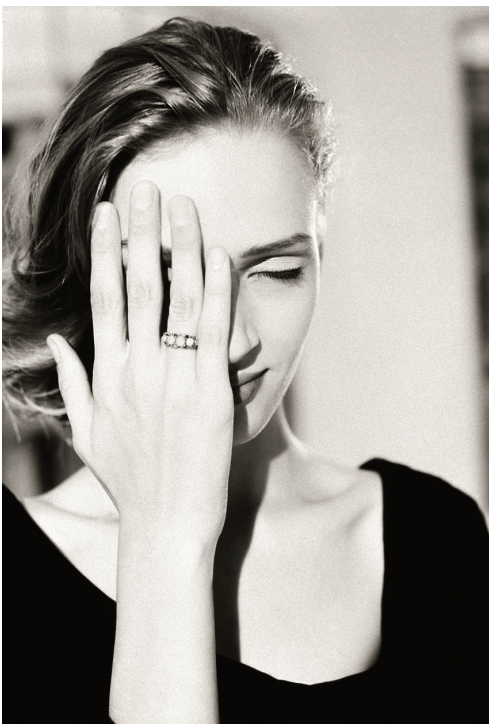
Uma Thurman -1990 shot in London for British Vogue