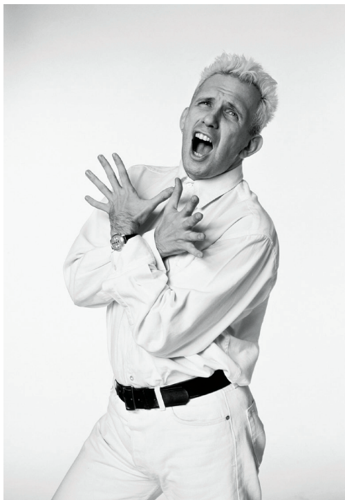
Jean Paul Gautier. British Vogue London 1991