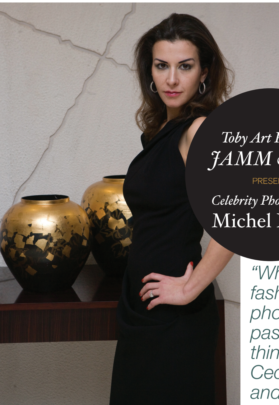
HH Sheikhha Lulu Al Sabah ©

This year's Dubai March arts calendar is more interesting than ever. The usual annual plethora of art fairs, starting with Art Dubai and ending with Sikka Art Fair, is being joined, amongst others, by Design Days Dubai and the Nuqat Design Conference. The city is also abuzz this March with all the galleries around town stepping it up too, as they should with the news of a new art space being inaugurated.